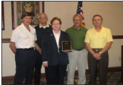
Quebecor World representatives received the 2007 Industry of the Year Award.