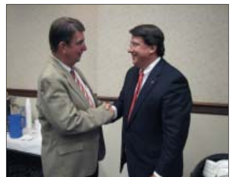
Chamber members met with elected officials at a Legislative Coffee.