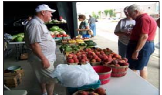
The new Farmer's Market opened in 2008.