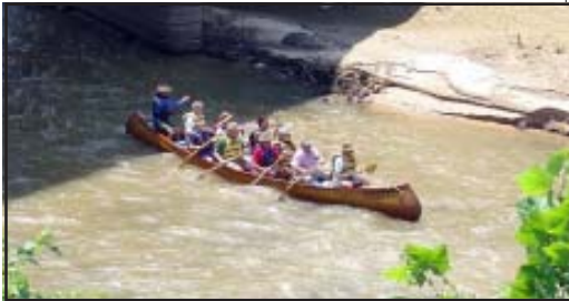
Canoe trip on the Forked Deer River.