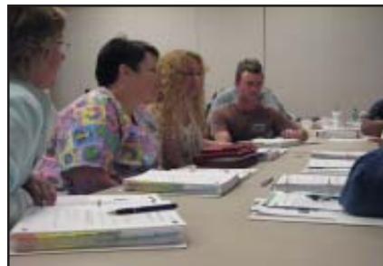
Participants in Operation Jump-Start